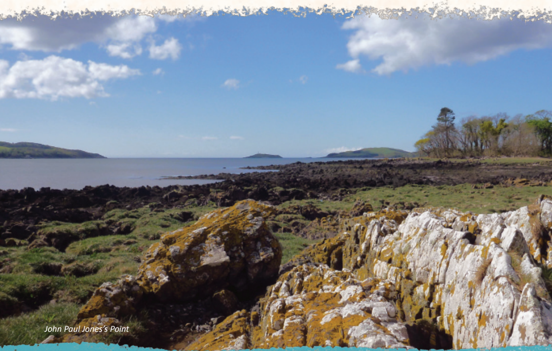
John Paul Jones's Point

At a T junction, turn right onto a track, still keeping the shore line on the right, and continue past a field with metal estate fencing. Turn right at the next T junction and follow the signposted track alongside another field to reach the road and then turn left to return to Kirkcudbright town centre.