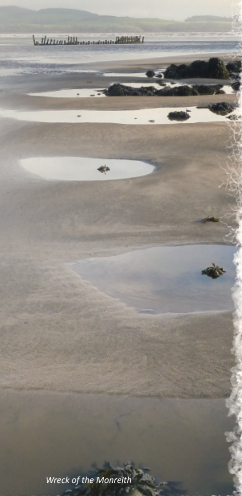
Wreck of the Monreith

Enjoy your visit to the coast but remember to be careful.