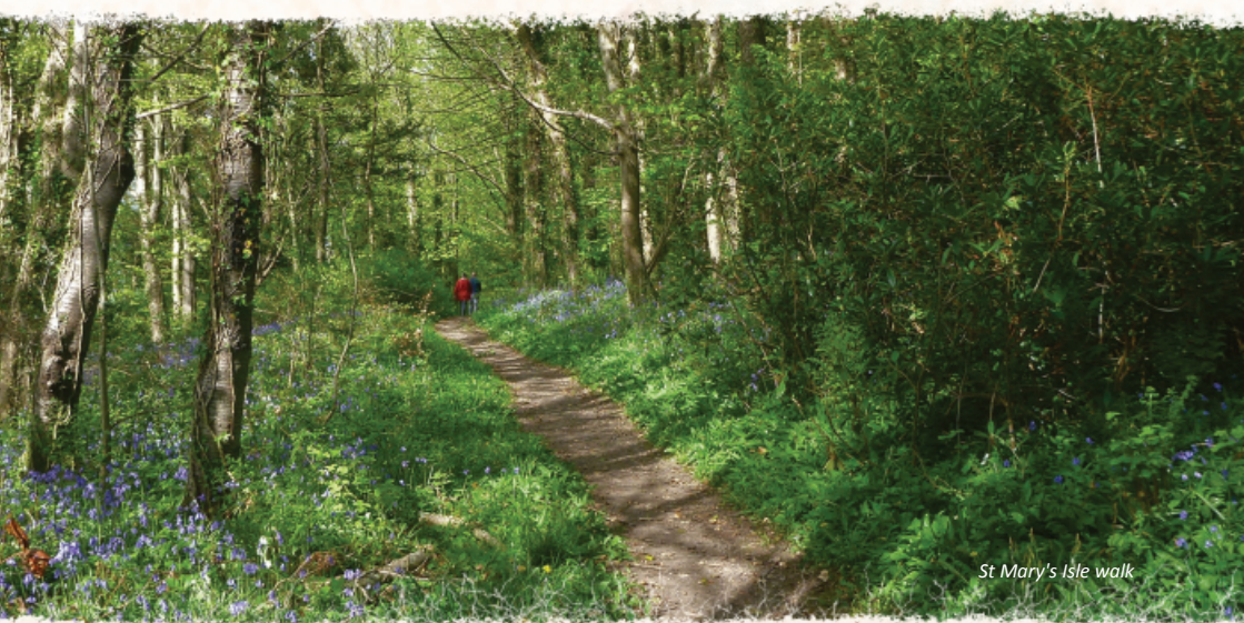
St Mary's Isle walk

St Mary's Isle became the seat of the Earl of Selkirk who built "The Isle" mansion on the site of the priory and established gardens, once considered to be "one of the loveliest spots in Scotland". The mansion house was demolished and replaced with another in 1897 which was lost to fire in the winter of 1940. The gardens fell into disuse but clumps of rhododendron and bamboo are garden escapes that are remains of exotic planting. Other reminders of past uses include the remains of a jetty at Slate Harbour and a ruined boathouse and slipway on the shore.