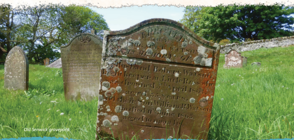
Old Senwick graveyard

There are paths which continue round the coast to Meikle Ross and Brighthouse Bay but the graveyard is a convenient stopping point where you can retrace your steps back to the car park at the Doon.